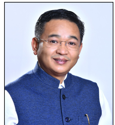
Prem Singh Tamang Chief Minister of Sikkim

The outburst of South Lhonak Lake on October 4 th , 2023, led to massive flooding and the destruction of Sikkim's largest dam, the Chungthang Dam. The Teesta III Hydro Power Project, built at a cost of ₹13,965 crore