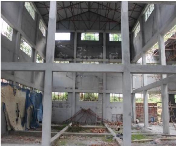
Main Plant Area